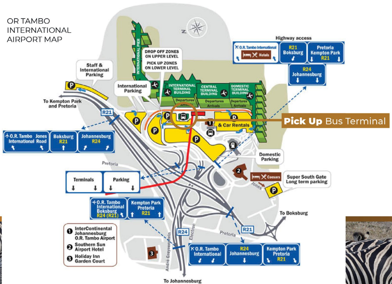
OR TAMBO INTERNATIONAL AIRPORT MAP

GARDEN COURT OR Tambo Airport 011 974 5202 3Km Max - Uber/Taxi